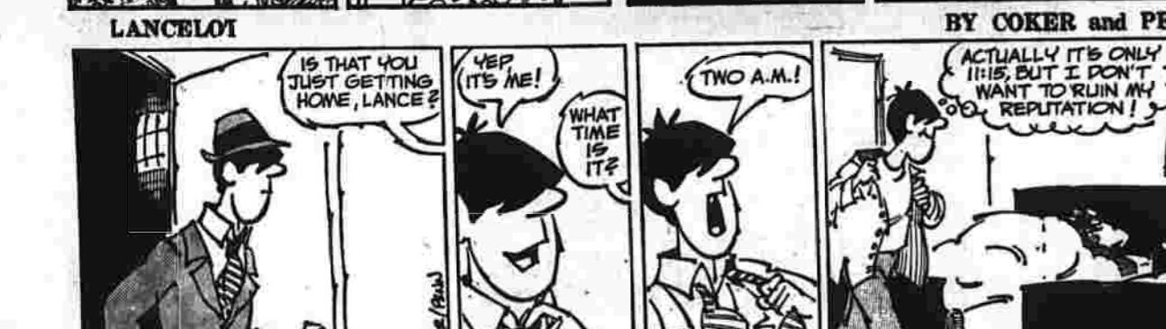
LANCELOT BY OKER and PENN