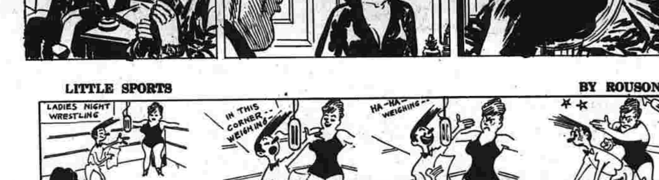
LITTLE SPORTS BY ROUBON