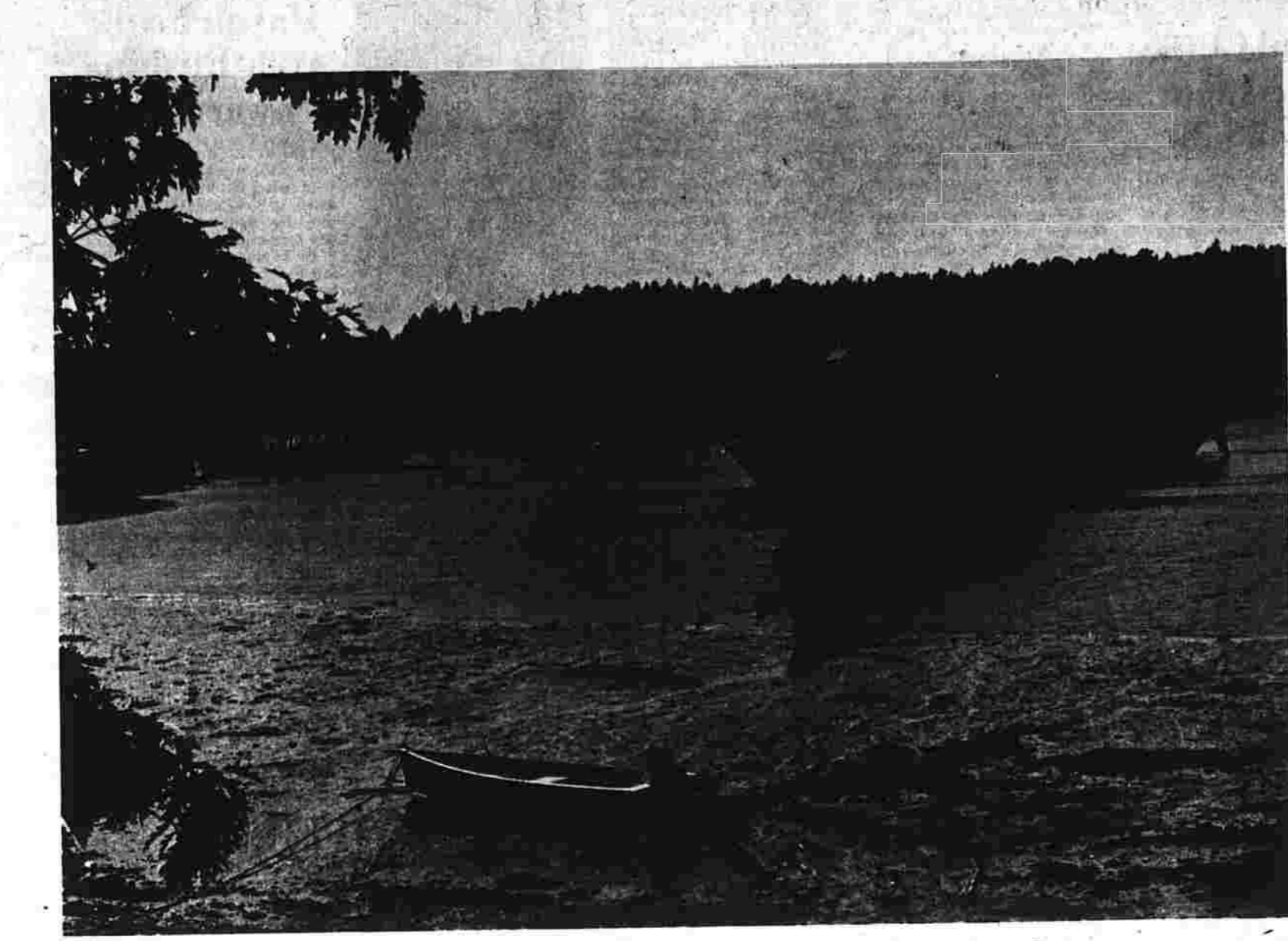
LOW TIDE, BOOTHBAY HARBOR, MAINE