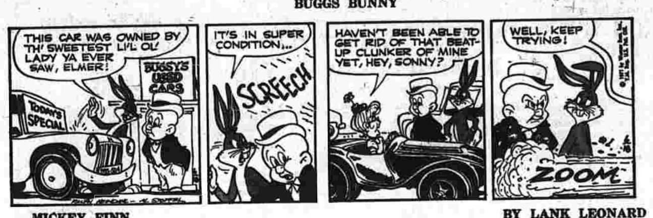
BUGGS BUNNY BY LANK LEONARD